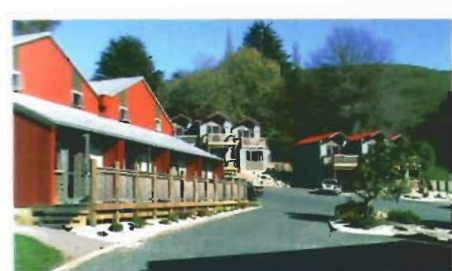
Waitomo YHA: Accommodations from stately motor hotels to the sparkling Kiwi Paka YHA now adds a new motor lodge-type option to it's ultra-clean Backpackers formula.

The main attractions naturally are the numerous caves to be explored in different manners. We started with a visit of the Waitomo Museum of Caves to learn all about the famous glowworms and how the caves were formed. We then visited Waitomo Glow Worm Caves on a easy walking tour where you end with a boat ride underground on the river. Beautiful stalagmites and stalactites (do you still remember which ones go up or down?). The next day, we decided to explore some other caves in a more sportive way.